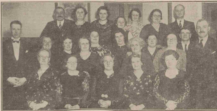
The ladies and gentlemen who organised the successful dance held on Friday last by the Grangemouth Chapter, Order of the Eastern Star.