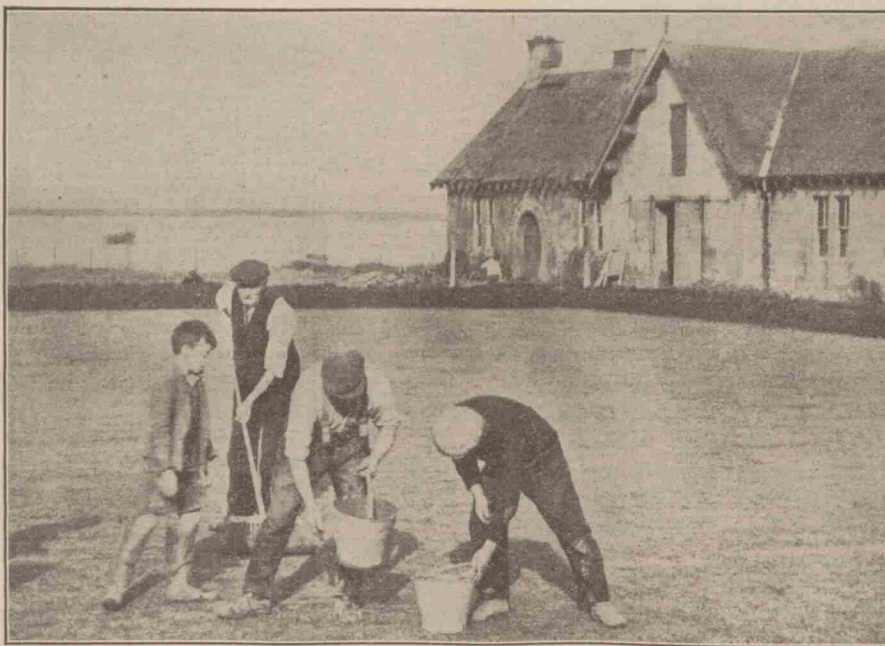
Villagers at work on formation of bowling green at Dunmore. Turfing has been completed, and green is expected to be ready for next season.